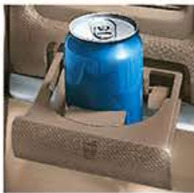
Dashboard cup holder