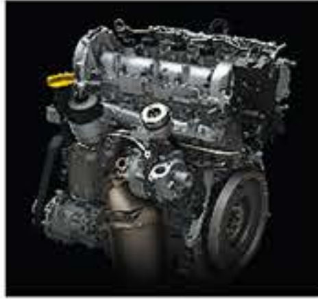
K14 VVT Petrol Engine: Light, compact and efficient

While the K14 VVT petrol engine delivers maximum efficiency through its light weight and compact size, the D13A DDiS Super Turbo diesel engine pumps in enough power to move smoothly on any terrain.