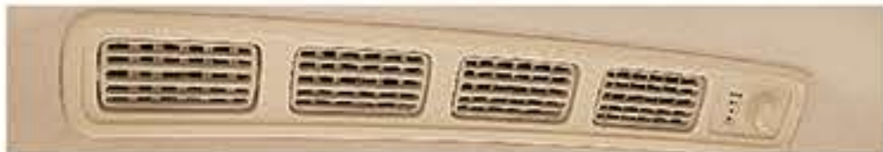
2nd row AC with controls