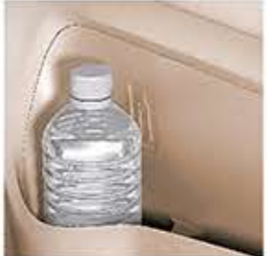
Front and rear door pocket