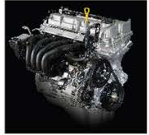
D13A DDiS Super turbo diesel engine: Superb performance