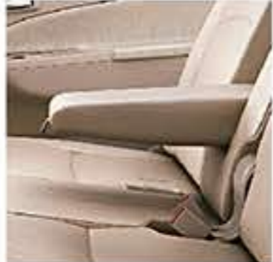
2nd row arm rest for comfort