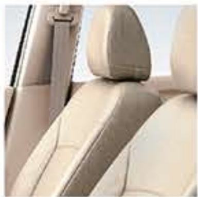
Textured premium upholstery